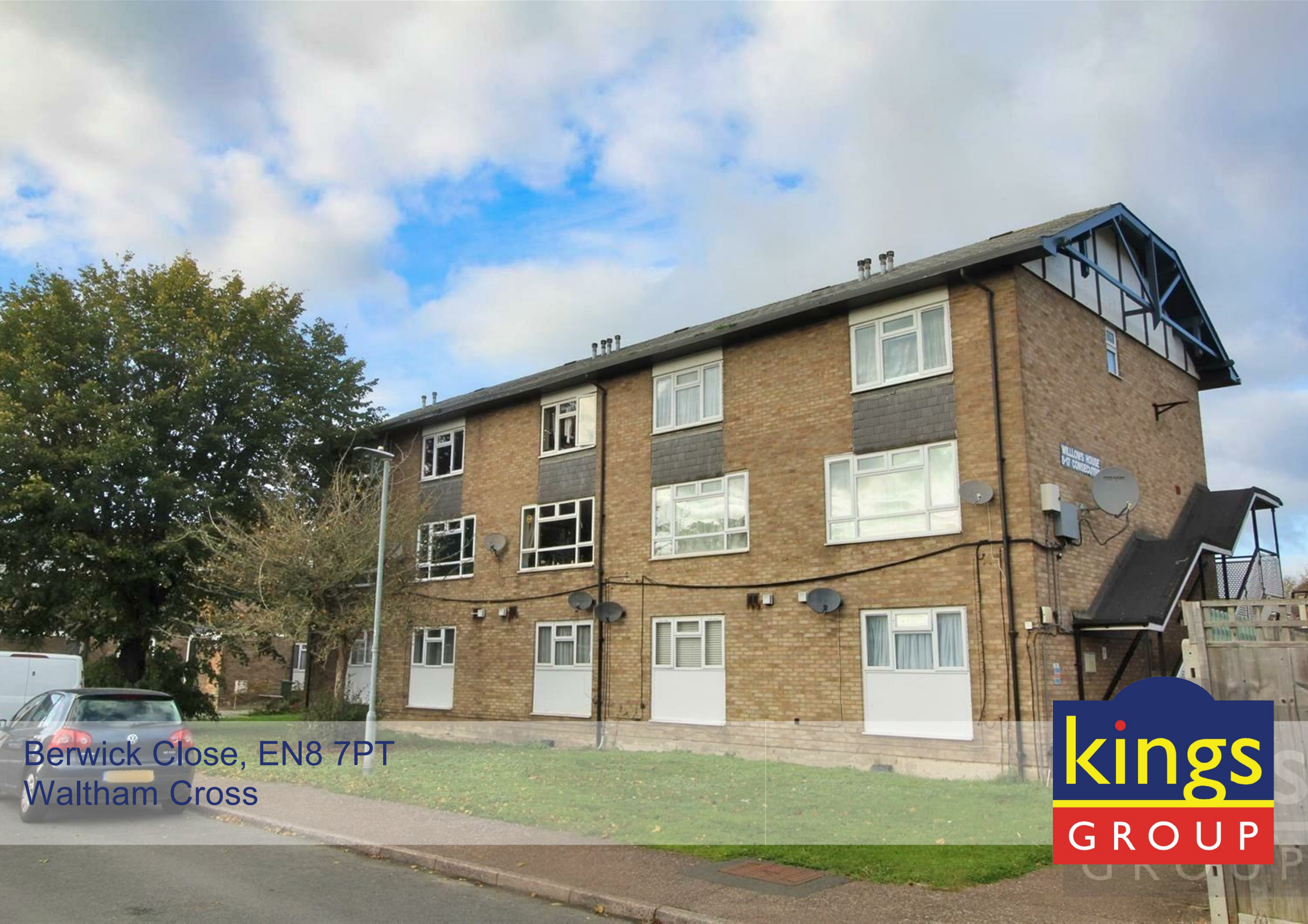
Berwick Close, EN8 7PT Waltham Cross